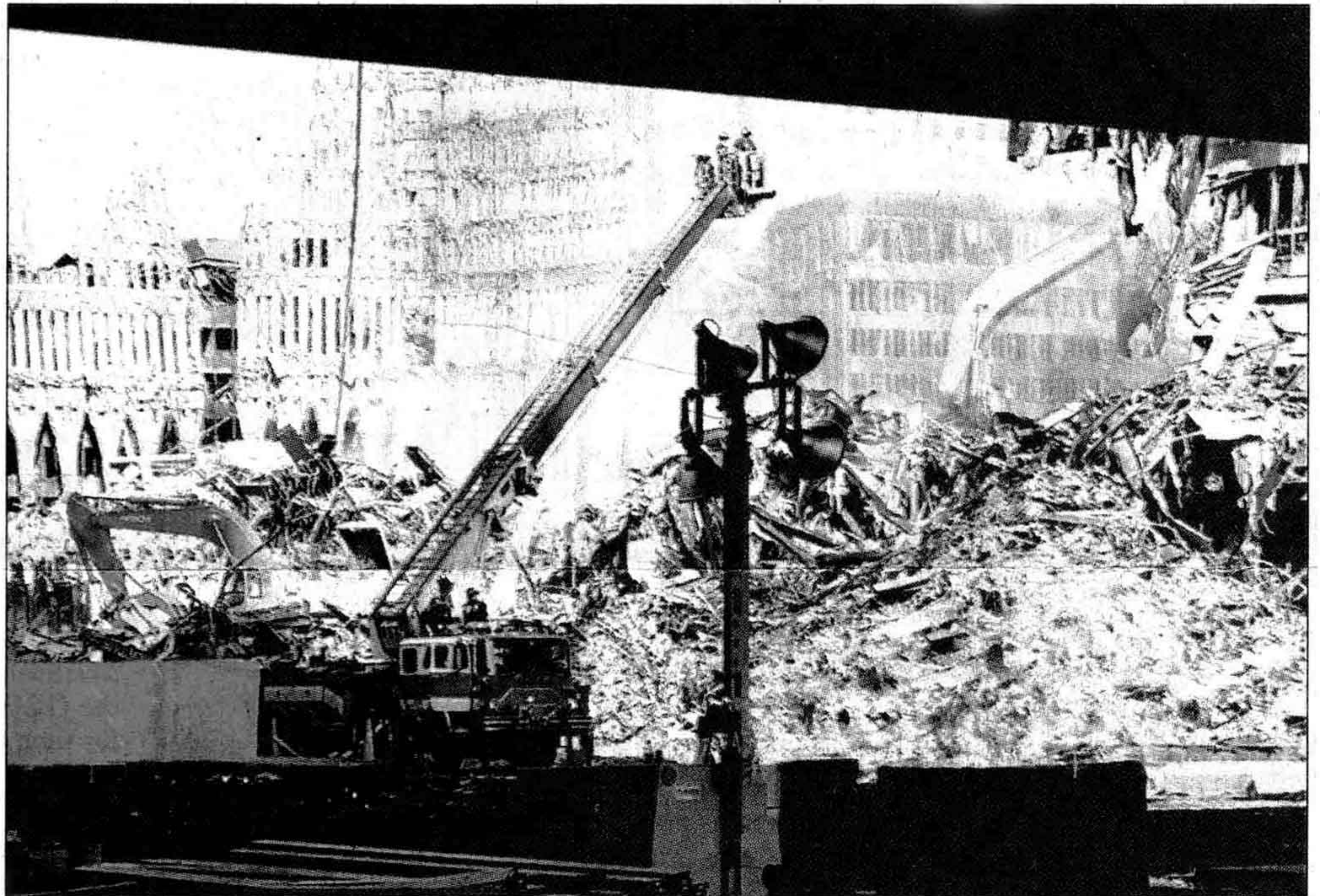
SPECIAL TO THE DESERT SUN

But she was evacuated from her hotel on Sept. 11 and not allowed to return until 6 p.m. Then